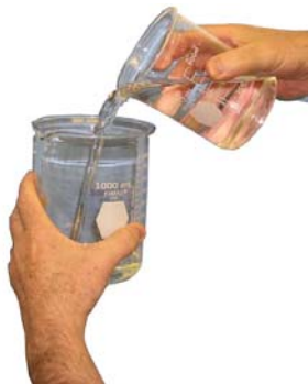
Pure Silicone Fluid 1.5cSt has a viscosity similar to water.

Super Low-Viscosity Volatile Silicone: Decamethyltetrasiloxane (CAS 141-62-8)