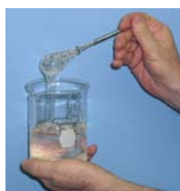
Blended viscosities from 1cSt to 100,000cSt available.