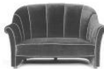
Provides scuff resistance to leather, & vinyl upholstery

CWSC #60 is primarily used as a lubricant and release agent for applications involving plastics, rubber and polyurethane/polystyrene foams. It can also be used as a release agent for manufacturing rubberized belts, as a lubricant to prevent wear and increase abrasion resistance to latex rubber, as a release agent in the printing industry, as a lubricant for yarn and sewing threads to eliminate friction and tension, and as a finish to improve water-repellency and scuff resistance for leather, vinyl and foam upholstery.