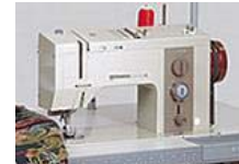
Reduces friction to sewing threads.