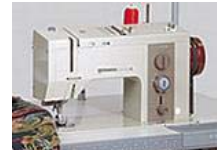
Reduces friction to sewing threads.