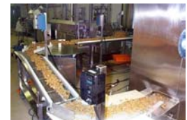
Meets FDA Specification 175.300 for incidental food contact.