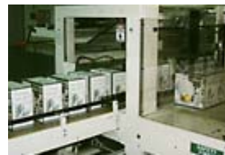
Allows materials to slide on food processing lines.