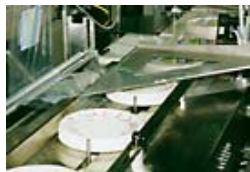
Water-based – contains no solvents.

Clearco Food Grade White Silicone contains 35% Silicone Solids . It is ready to use and can be diluted with cool tap water to achieve desired consistency.